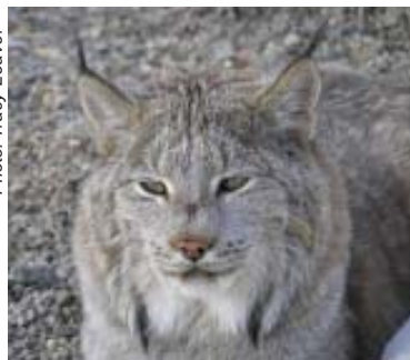
Lady Jane - Canadian Lynx.