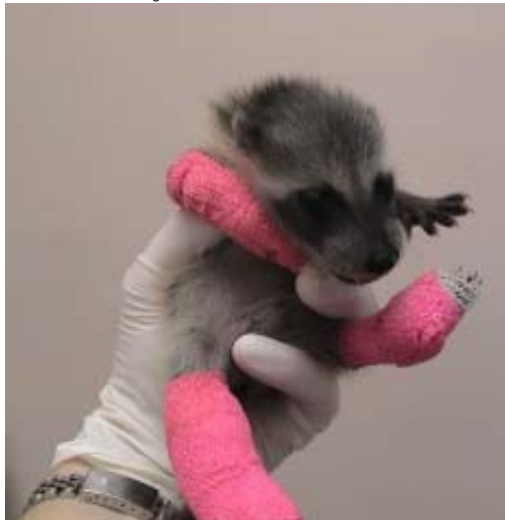
Infant raccoon injured during tree cutting.