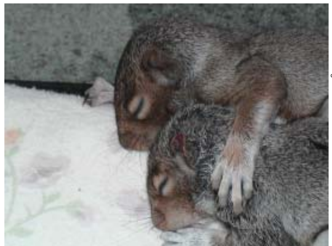
Infant gray squirrels.

Our "baby season" began mid-March with the arrival of newborn gray squirrels. The rest of the season was busy with a constant influx of just about every wild animal you can imagine including a mink and a musk turtle for variety. The bulk of our wild patients are raccoons, rabbits, skunks, squirrels, foxes, woodchucks and box turtles, with as many as 70-80 in our care at any given time. Some arrived with severe injuries, some orphaned and others sick. The hardest on us are those animals injured by un-caring humans. On the other hand, our very caring staff and volunteers gave thousands of hours of work that was hard, bittersweet, sometimes miraculous and always rewarding. Their generous gifts of time made sure each and every animal got the best care possible. They cared for broken and burned, lost or orphaned,