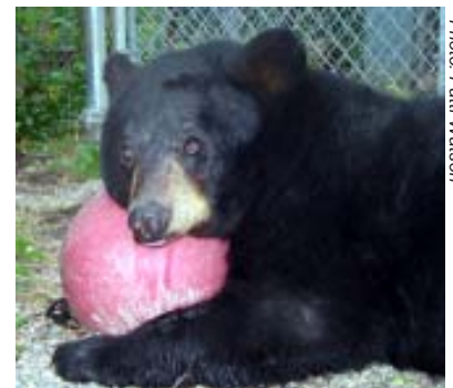
Grace - American Black Bear.