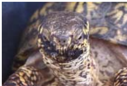
Tank - Eastern Box Turtle.