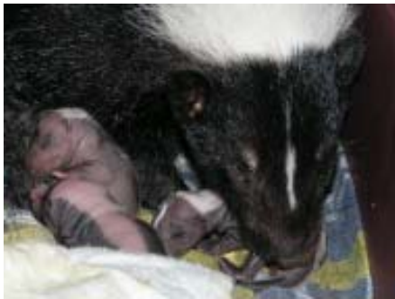
Mom skunk and newborn babies.