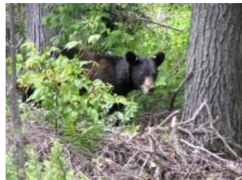
July 2006 - 130 lbs. Our 25th bear released!