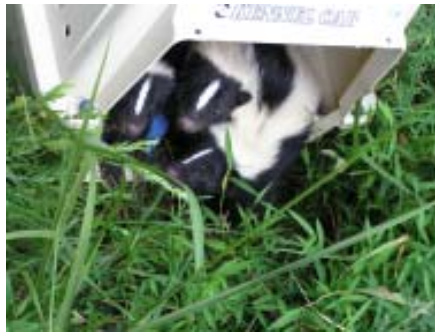
Mom's babies released!