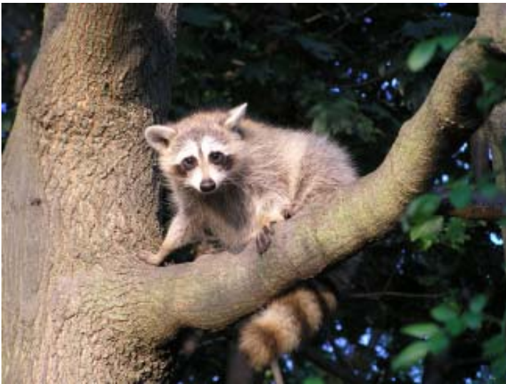
Burned raccoon, rehabilitated and released.

dehydrated and emaciated as well as mangy and cranky patients. It is because of the staff and volunteers that so many of the animals survived and were released. This work is truly done with blood, sweat, tears and plenty of heart. The reward is releasing these wild spirits.