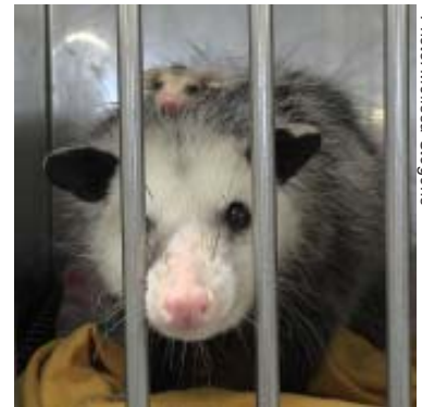
Mom - Virginia Opossum.